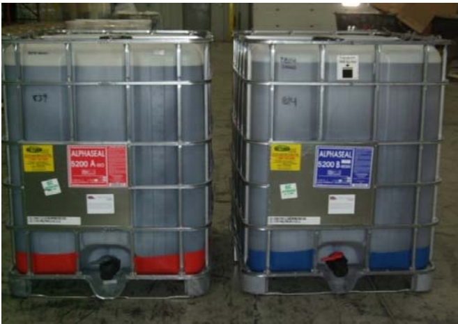
Figure 4 - AlphaSeal 5200 330 Gallon Caged Totes