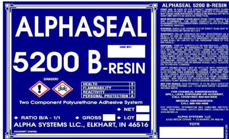
Figure 3 - AlphaSeal 5200 B-RESIN Tote Label