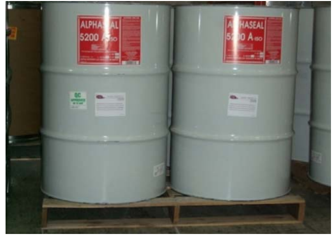
Figure 5 - AlphaSeal 5200 55 Gallon Steel Drums