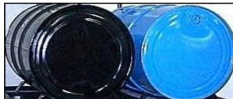
Figure 3 - 55 Gallon Steel Drums