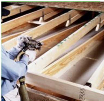
Figure 2 - Application for Foamseal F-2100 Adhesive

A Pei test report no. 2019-6160 - 12 Month Shelf Life Test Using F-2100 Two-Part Adhesive - Dated: 10/17/2019