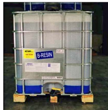
Figure 5 - Foamseal F-2100 Resin NT Blue Tote