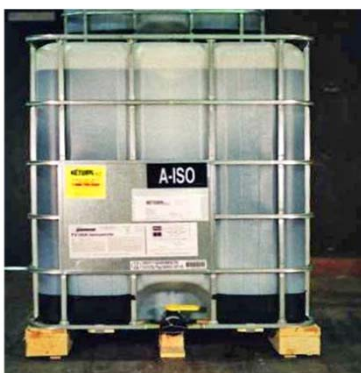
Figure 4 - Foamseal F-2100 ISO NT Black Tote